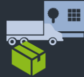
Supply Chain Management & Manufacturing