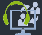
Application Management Support